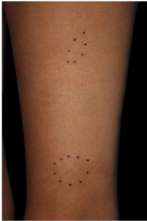
Figure 1 Subcutaneous nodules on the left thigh.

and right forearm (Fig. 1). There was no palpable lymphadenopathy. There is a biopsy of one of the subcutaneous indurations that showed non-caseating epithelioid cell granulomas involving the subcutaneous tissues (Fig. 2). Chest X-Ray showed bilateral hilar lymphadenopathy, and computed tomography revealed mediastinal lymphadenopathy. Laboratory examination showed normal liver and renal function, as well as increased levels of angiotensin-converting